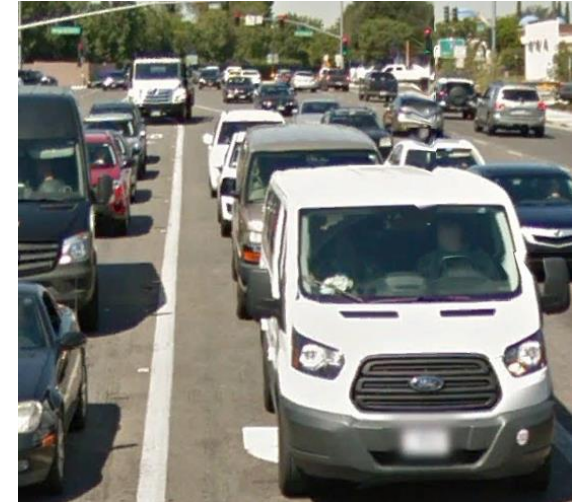
Preliminary Traffic Volume Analysis February 2018