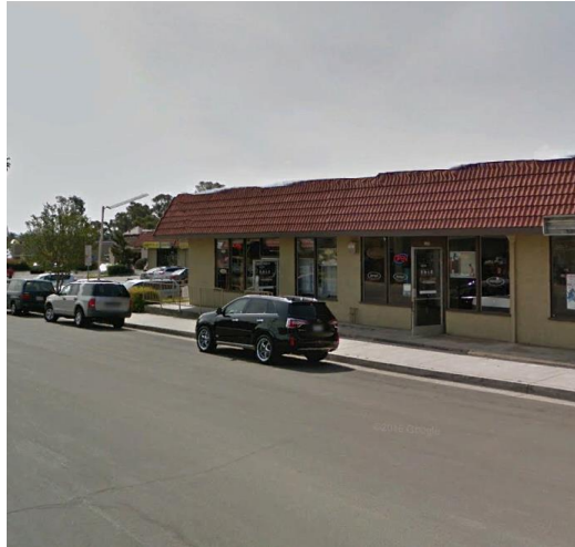
Preliminary Right-of-Way Impacts Analysis December 2017